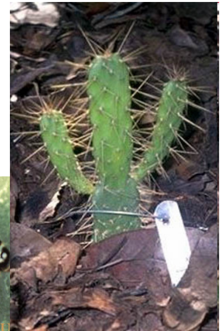
A Fairchild-grown Opuntia corallicola reaches for the sky in its new home.