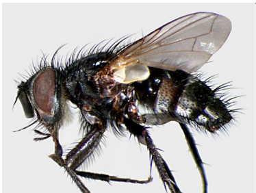
Lespesia archippivora vs armyworms Loss of Agrotis crinigera