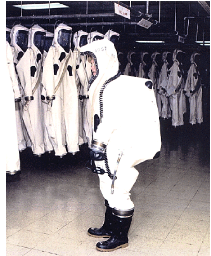
Propellant Handlers Ensemble Coverall (a Self-Contained Atmospheric Protective Ensemble (SCAPE) designed to protect the propellant handlers from exposure to toxic hypergol propellants)